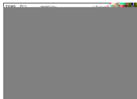
Wave Soldering (Flow Soldering)