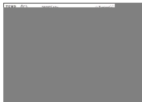
Wave Soldering (Flow Soldering)